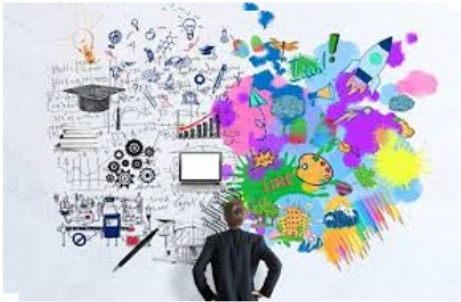
The Labyrinth of Imagination: Strategies for Paying Attention and Developing Your Creative Self

This humanities class will explore ways students can appreciate the importance of creativity in every area of their personal lives and in any profession they choose to enter. Students will consider how to get out of the rut of the usual and see the world anew. “Make it new” as Ezra Pound said, or feel “like some watcher of the skies/when a new plant swims into this ken” as John Keats said. The world is bigger than we know. We will ask how we express ourselves and why that is important. We will explore a variety of expressive arts activities including writing and drawing, both individually and in groups. First, we want to explore strategies for “digging deeper” and then consider the best ways to express what we find with increasing precision and originality (eschewing cliches). Students will have the opportunity to encourage, advise, and collaborate. We will explore the history and mythology of the ancient labyrinth as a way to take an inner journey and cultivate mindfulness (“The awareness that arises out of paying attention on purpose, in the Present Moment, without judgment.”- Jon Kabat Zin).