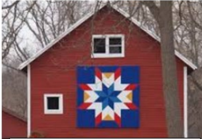
How to Paint a Barn Quilt